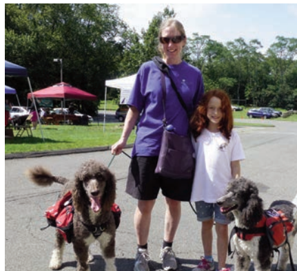
Families - furry or not - all had a beautiful walk at Earthplace at the Walk for Wildlife Event.